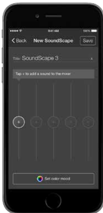
Figure 3: Sound Mixer for the ReSound Relief™ app. The volume for each sound can be adjusted using the slider. This allows for dynamic soundscapes that can be created and personalized by the user.

The ReSound Relief app also offers tinnitus information to support counseling concepts and provides beneficial tips for those suffering from tinnitus. In addition, it can record usage of the app, enabling users to automatically monitor the sounds they use the most. Sounds from the ReSound Relief app can be streamed to ReSound LiNX 2 ™ hearing instruments and combined with amplification to compensate for potential hearing loss. As a majority of tinnitus sufferers also have some degree of hearing loss, this is the optimal solution. For tinnitus sufferers without hearing loss, the app can also be used simply by plugging in a set of headphones. Thus, independent of the hearing loss configuration, this is a very valuable tool for people with tinnitus. It is available as a free download on both the App Store SM and Google Play. For more information visit the ReSound Relief™ website: www.gnresound.com/reliefapp .*