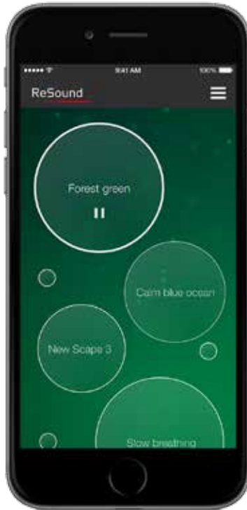
Figure 2: Homescreen for the ReSound Relief™ app. The large bubbles represents soundscapes and the smaller empty bubbles can be popped for a relaxing tactile exercise.

integrate auditory, visual and tactile cues to help distract them from focusing on their tinnitus. Each soundscape can be personalized by name, mood color, and a layering of multiple sounds. Up to five sounds can be layered in any individual soundscape by using the sound mixer (Figure 3).