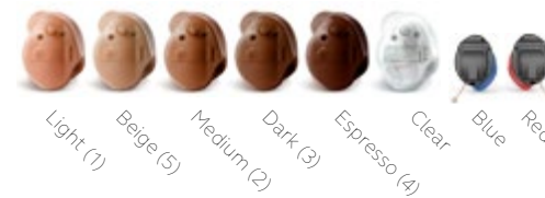
ReSound Enya™ RIE and BTE