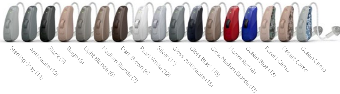
ReSound LiNX Quattro 62 RIE, ReSound LiNX 3D™ and ReSound LiNX2™ RIE and BTE